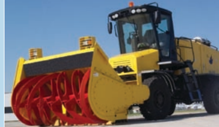
New high capacity Snow Wolf SB-520 from Airport Technologies Inc. (ATI).

Southport is one of only a handful of leading industrial locations in North America that operates its own public airport. This modern facility has four operational runways, multiple navigational guidance systems and runway lighting. We have airside-zoned land available for lease. It's a perfect location for an aviation-related company. For business or pleasure, Southport airport is ready for your next flight.